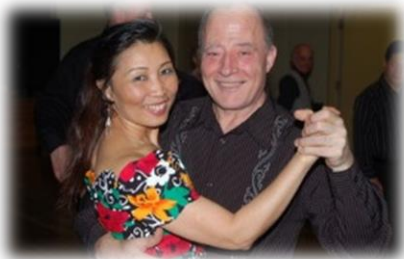
Open Ballroom & Line Dancing