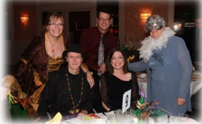
Louisiana Royale Masquerade Ball