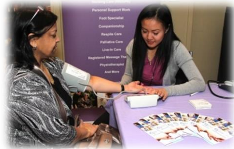
Active Living Fair

As a part of its community outreach measures, our Centre hosted its 8th annual Seniors Information and Active Living Fair on March 20 th and 21 st featuring 60 exhibitors, 4 speakers and 3 health clinics. Much to our delight, Voices 4 Ability (an internet radio station), broadcast from the Centre on both days. We estimate more than 650 people attended this two-day event, with the efforts of staff and 62 volunteers ensuring its success